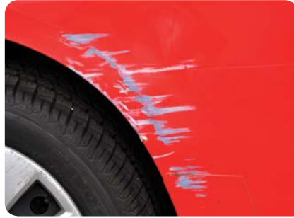
7. Scratched Panel