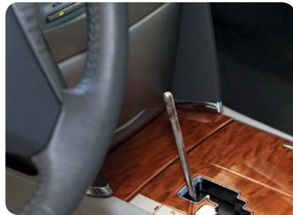
3. Missing Accessory