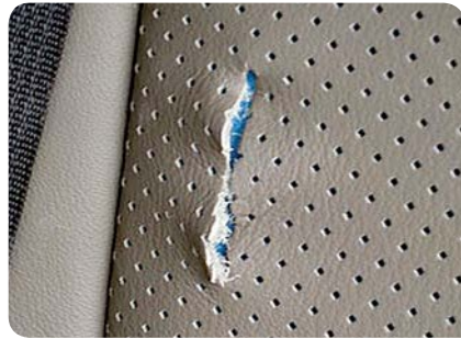
1. Cut Seat