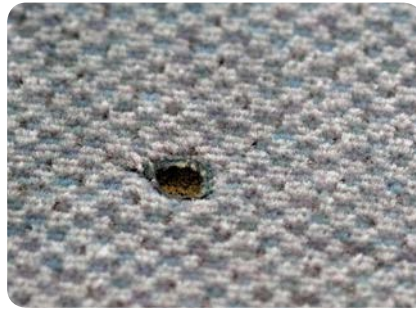
2. Burned Fabric