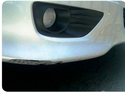
6. Scratched Bumper