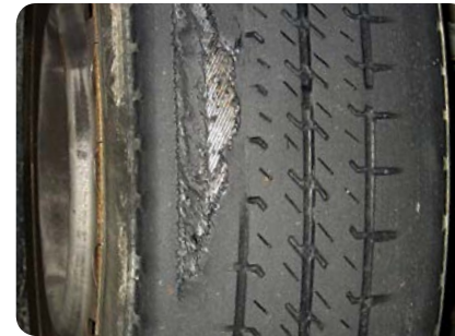
11. Exposed Tire Cord