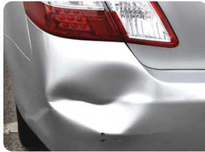
5. Dented Bumper