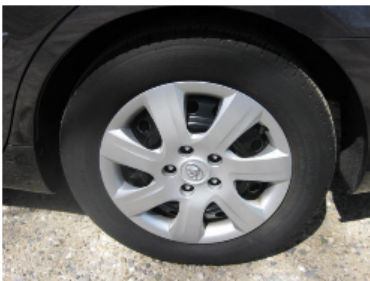
LT FT TIRE