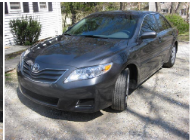
FT 3/4 VIEW (LT)