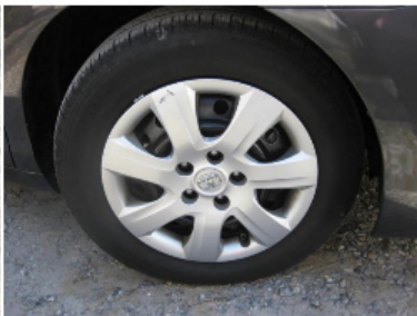
RT RR TIRE