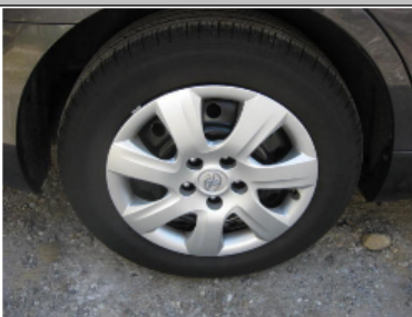
RT FT TIRE