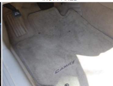
LT FT FLOOR