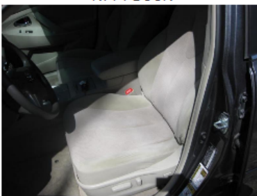
INTERIOR - DRIVERS SIDE