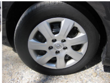
LT RR TIRE