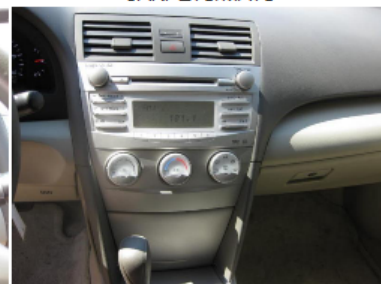
CENTER CONSOLE/GEAR SHIFT