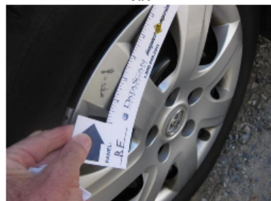
REAR LEFT WHEEL/COVER