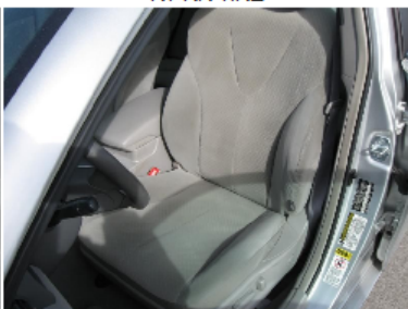
LT FT SEAT