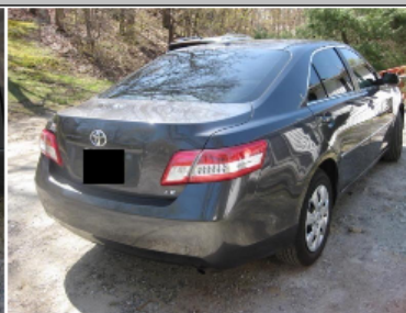
LT RR 3/4 VIEW