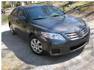
RT FT 3/4 VIEW