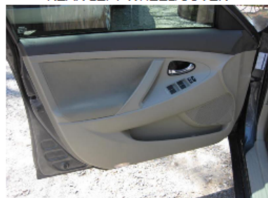
LT FT DOOR