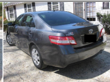
RT RR 3/4 VIEW